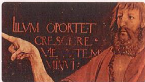
DETAIL OF THE BISHOPRY ALIANCE BY MATTHIAS GRUBER/ARND BRONKHORST/WIKIMEDIA COMMONS