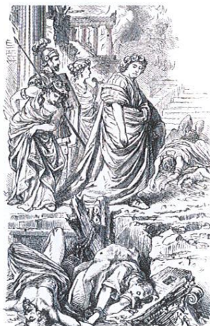
ROMAN EMPEROR NERO, LEFT FROM 'HISTORY OF THE CHURCH' AROUND 1880

Instead of worrying about the end of time, an Antichrist, a final battle, and “evil” numbers, Catholics are encouraged to believe that Christ has already conquered sin, death, and Satan. God’s reign is already here in our midst (see Luke 17:20–21). Our task is to prepare for our own moment of dying and meeting the Lord. We leave the rest to God’s providence!