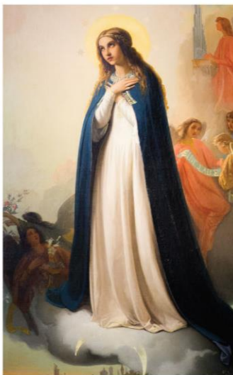
THE ASSUMPTION OF THE VIRGIN MARY, PAVIA CATHEDRAL